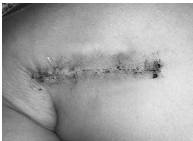
Fig. 3 – The right vertical infra-axillary incision in group C.

closure were the same as used in the group A. Finally, we closed the incision with a continuous intradermal suture for the skin.