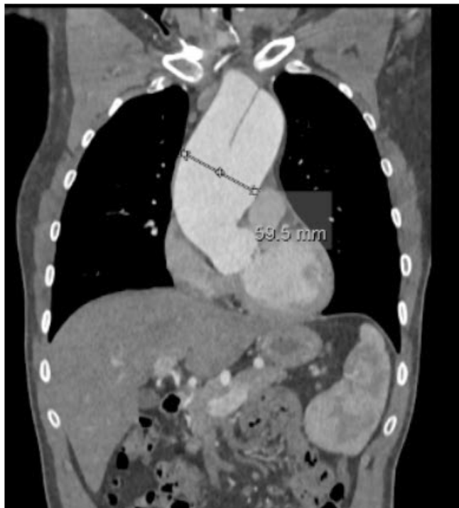
Fig. 2 – Thoraco-abdominal CT scan on the day of the first diagnosis, showing aortic aneurysm and dissection membrane.

Surgery was carried out under general anaesthesia using cardiopulmonary bypass and hypothermic circulatory arrest with selective antegrade cerebral perfusion. Careful inspection of the unicuspid aortic valve revealed slightly fibrosed valve leaflets. Considering that there had been ten years of non-progressive,