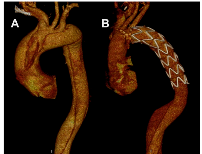
Fig. 2 – Preoperative (A) and postoperative (B) computerized tomography angiography images of frozen elephant trunk modification; zone 3, fixation with islet-shape arch repair.

post hoc analyzes with Bonferroni correction was considered significant at values < 0.0167, and adjusted P -values were used in other post hoc assessments. For statistical analysis, IBM Corp. Released 2012, IBM SPSS Statistics for Windows, Version 21.0, Armonk, NY: IBM Corp. was used.