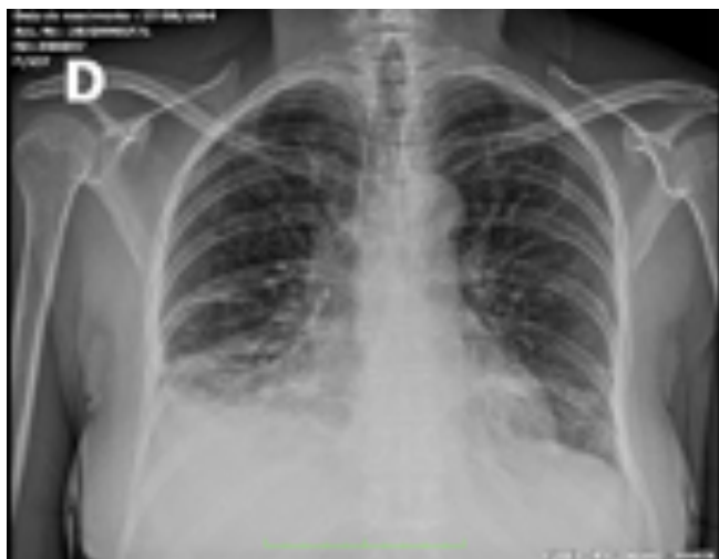
Fig. 1 - Anteroposterior chest radiograph.

Due to the pandemic, all patients screened with suspected SARS-COVID-2 infection are placed in respiratory isolation and undergo serology test with RT-PCR (reverse transcription polymerase chain reaction). In the evaluation of laboratory tests, arterial blood gases with hypoxemia and respiratory acidosis (pH 7.36, pO 2 58.4, pCO 2 , 39.8, BE -3, sO 2 89%) were found, as well as D-dimer of 1580 ng/mL, eosinophilia (69 mm 3 ) and normal lymphocytes. Chest radiography (Figure 1): thickening of the pleuropulmonary interstitium, infiltration of the alveolar pattern in the right lower lobe, obliteration of the right costophrenic sinus. On chest tomography (Figure 2): bilateral pleural effusion, ground-glass opacities and smooth thickening of the sparse interlobular septa throughout the lungs. Consolidation of air space with air bronchograms in the lower lobes. The RT-PCR test was positive.